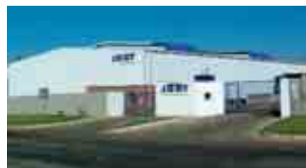
Renovations finished: JOST South Africa

Even the plans from JOST South Africa are being dominated by the 2010 Soccer World Cup. Major construction projects are being brought to fruition, which