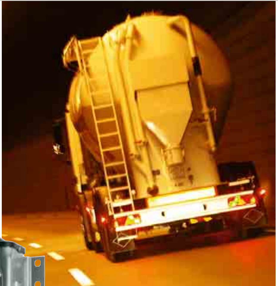
Silo and tipping trailers require especially robust landing gears to support the back. For this, JOST offers the right solution in its Modul CS.