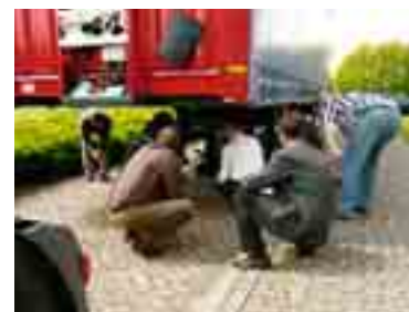
Take a closer look...

JOST demonstrated its various sensor couplings, its KKS automatic coupling system, the LubeTronic lubrication solutions and FlashTronic and the optical locking display. Through hands-on experience, participants were able to convince themselves of the ways in which these sensor solutions make daily life easier for users.