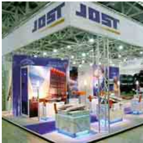
For the first time in Moscow

In Moscow, people were able to see JOST twice this spring, once at Comtrans in April and once at the CTT in June. JOST Russia participated with its own trade fair stand. Products from TRIDEC were presented here as well as at the Commercial Vehicle in Birmingham. In Germany, people can view the range of products from TRIDEC for the first time at the JOST stand during the IAA.