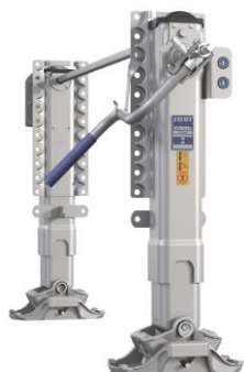
Electric landing gear Modul E-Drive: