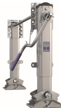
Weight-optimised landing gear OPTIMA: